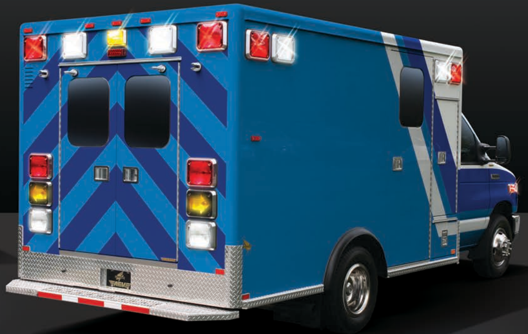
TYPE III DR-92 E-350