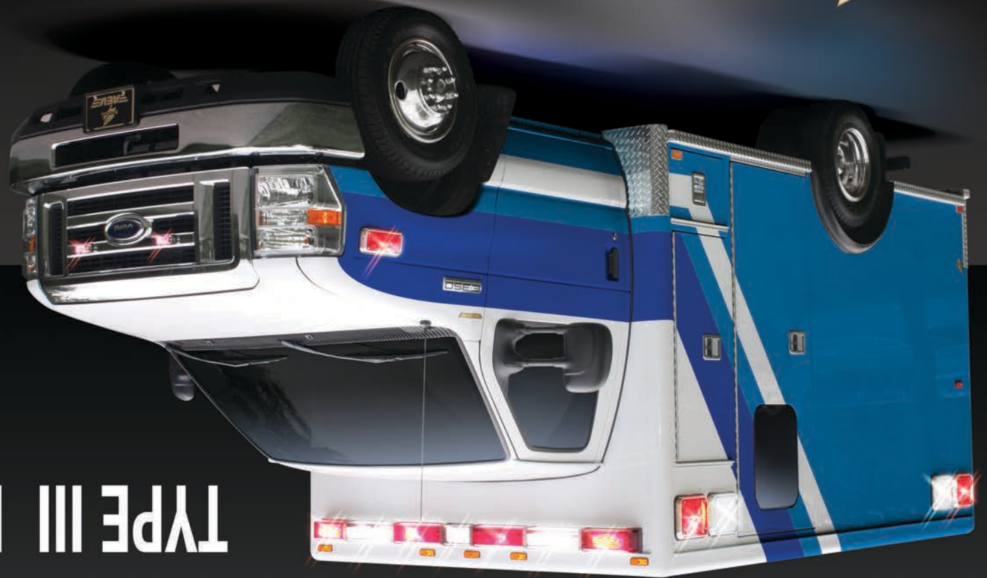
TYPE III DR-92 E-350